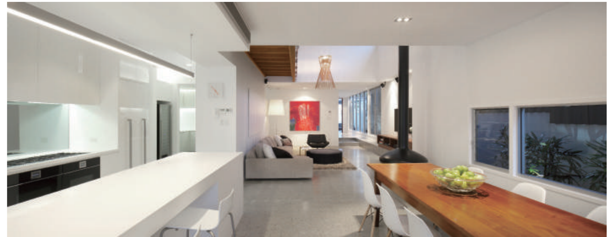
A large central void joins the new and the old parts of the house and allows for the sunlight from the north to flood the living space.