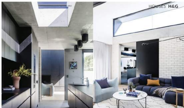
FAMILY ROOM above right A sliding door between this room and the kitchen enables the children's wing to be closed off. Vintage 'La Bambola' chair, Istaba; Sofa, Sefer; Coffee table, Cult; Wall light, Euro luce; Rug, Amadillo & Co; Linen curtains, Warwick Fabrics. MAIN ENSUITE The aged-brass finish on the Astro Walker tapware references the original cottage. Zuster 'Zi' mirrors, Reeco; Porcelain benchtop in Calocotta Paragon, Ardemus. Bluestone wall-floor tiles, Eco Outdoor; Stool, Living Edge. Smart buy: Baxter+Punch 'Heavy Metal' solid steel pendant lights, $265 each, Ardemus.